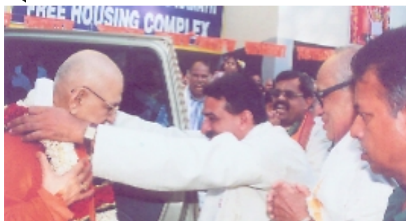
Welcome to Swamiji