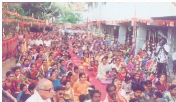
A view of the large audience