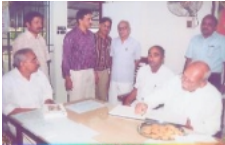
Sarsangachalak writing in the Visitor's book

Later replying to the reception accorded to him by the Trust, Sudharshanji emphasized that Indian culture always stood for world peace while the western culture promoted unhealthy competition which resulted in the growing cultural hatred among communities.