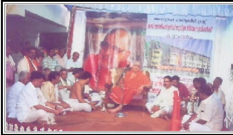
Swamiji giving Ashirvachan