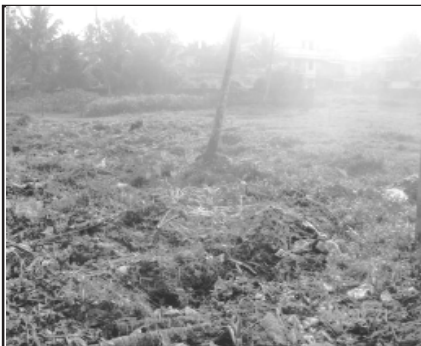
December 2004 Marshy land at Karnakodam

P.S.- Free transport available upto nearest boarding points after 8.00 p.m.