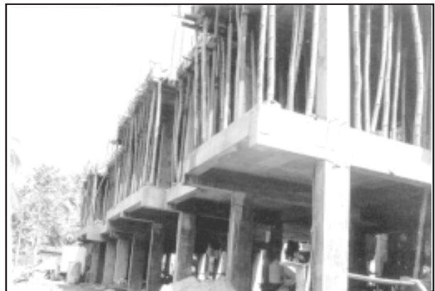
December 2006 - View of the building under constructions

The prestigious and unique housing project is on track and the construction work is fast progressing. When completed, this project can provide 38 deserving and eligible families with decent roof over their head and home for peaceful living. Selection procedures, Application format and Rules & Regulations for the day