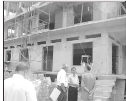
October 2006-building nearing completion